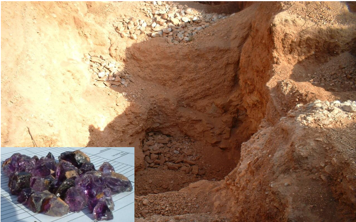
Artisanal miner's gemstone pit (inset: amethyst crystals)

This sub-sector has been identified as one of the key sources of economic growth and poverty reduction.