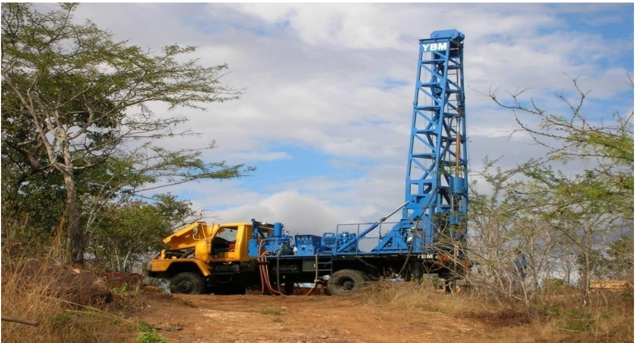
Exploratory drilling in progress