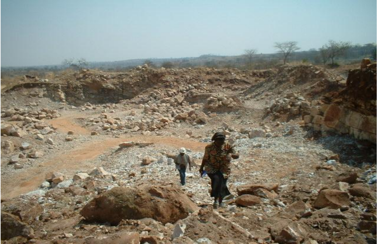
Abandoned quarry site